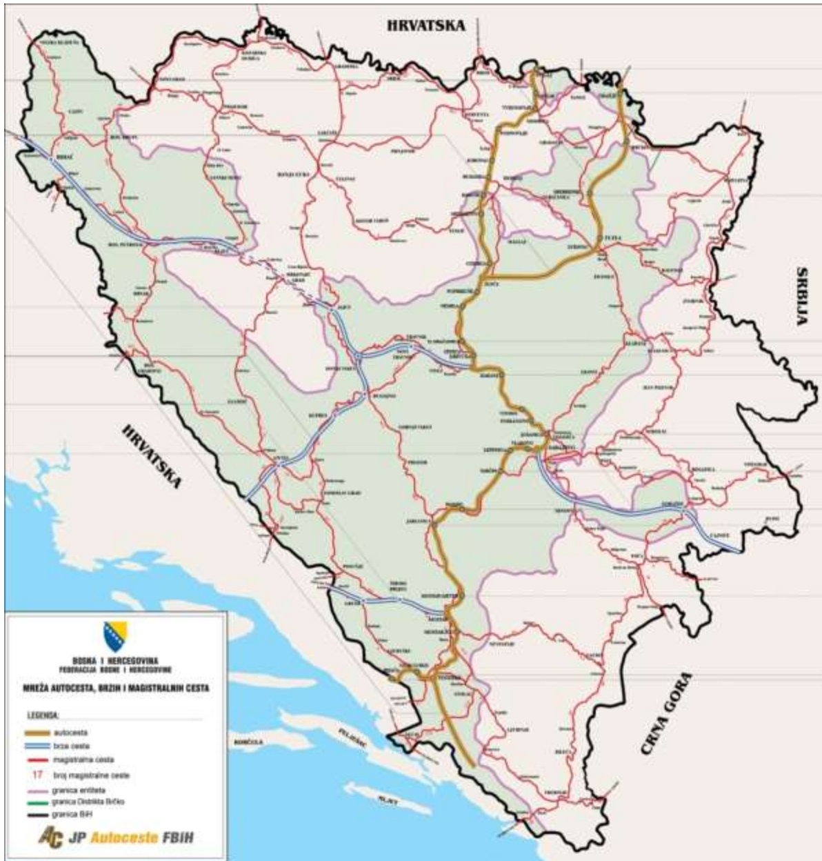
Map of motorways and expressways in Bosnia and Herzegovina