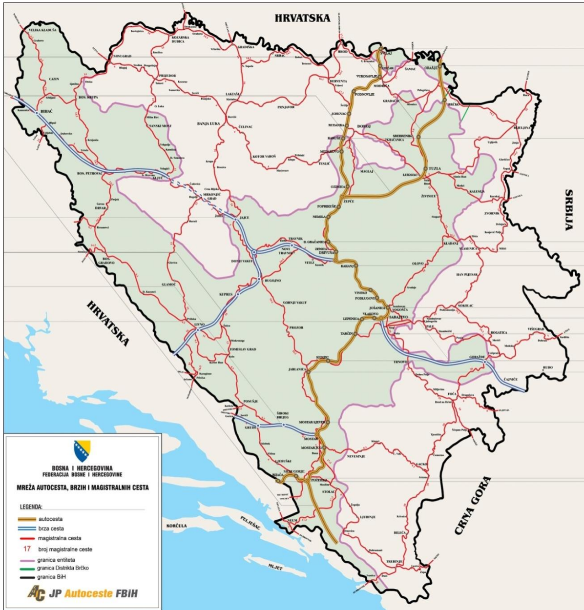
Map of motorways and expressways in Bosnia and Herzegovina