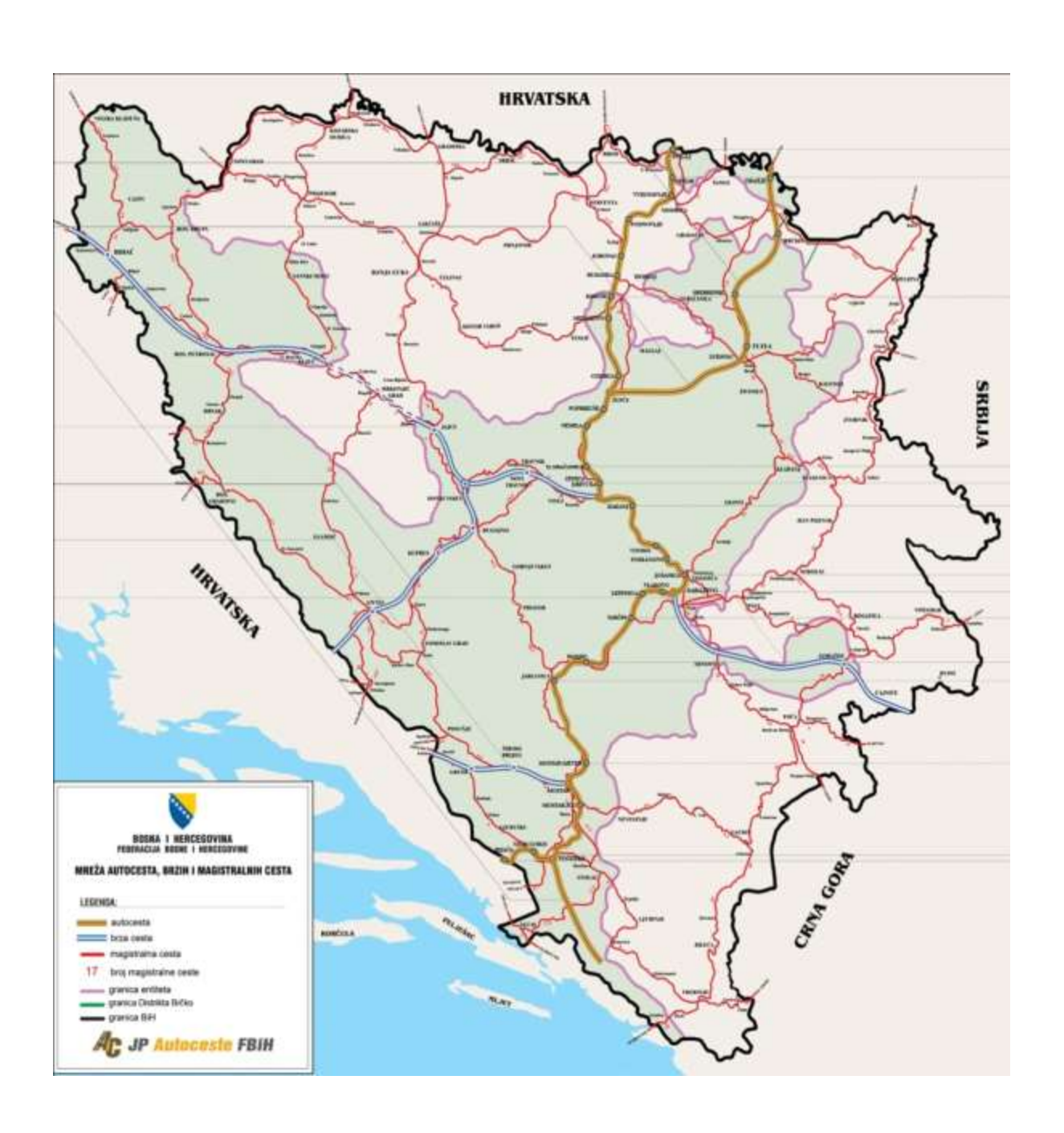
Map of motorways and expressways in Bosnia and Herzegovina