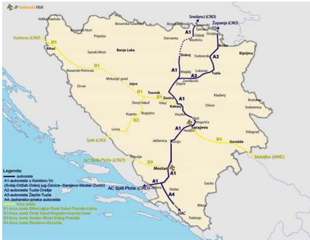
Image 1. Review of route of Corridor Vc and express roads in the Federation of BiH

Part of Corridor Vc passing through the Federation of BiH is 285 km long. In addition to this, there were plans to build motorway Žepče – Tuzla – Brčko – Orašje as well as several express roads that would be basis for connecting Federation of BiH with regional and further international traffic flow through modern roads: