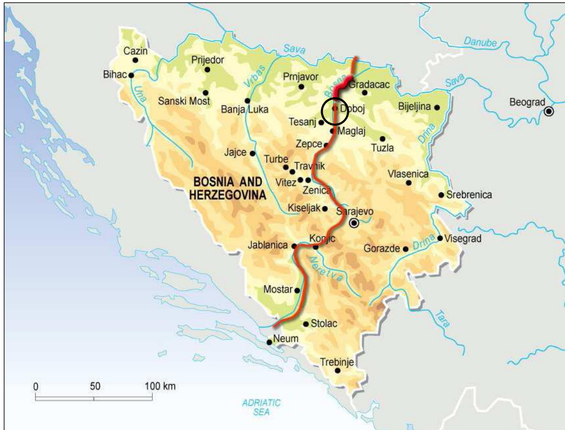
Figure 1 Project Location

The total length of the Project is 8.5 km. The Project starts at the inter-entity border within the tunnel Putnikovo Brdo 2 (the total length is 700 m, the tunnel length in FBiH is 120 m) and upon the exit from the tunnel descends southwards, forming an underpass for the local road, and continuing towards the Usora River. The Usora interchange is situated on the left bank of the Usora River and includes the first bridge – Usora 1. Upon crossing the River, the Project continues along the right bank of the Usora River and passes parallel with the regional road M-4, before crossing the Usora River the second time at the Tešanjka 1 bridge. The Project briefly continues along the left Usora bank before the third and final crossing of the River at the bridge Tešanjka 2. The Project continues southwards and in the area of Tešanjka village passes through the cut and cover tunnel Hrastik (220 m). Upon exiting the tunnel, the Project provides one underpass for a local road, intersects two streams which will be culverted, and crosses the Tešanjka River by bridges at five sections. The Project includes the Medakovo interchange and building of a traffic maintenance and control centre (TMCC).