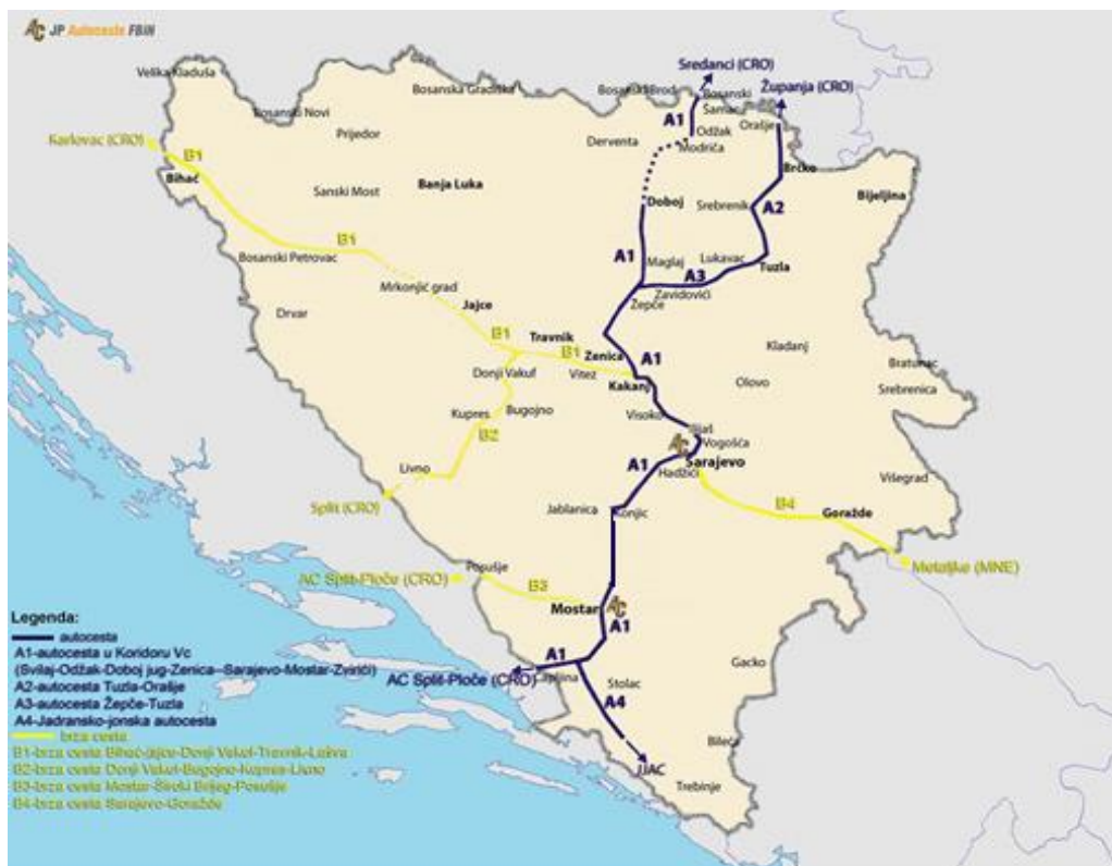
Picture 1 Overview of the Corridor Vc route and express roads in the Federation of BiH

The part of Corridor Vc passing through the Federation of BiH is 273 km long. In addition to this, the construction of motorway Žepče – Tuzla – Brčko – Orašje is also planned, as well as several express roads that would be basis for connecting the Federation of BiH with regional and further international traffic flow through modern roads: