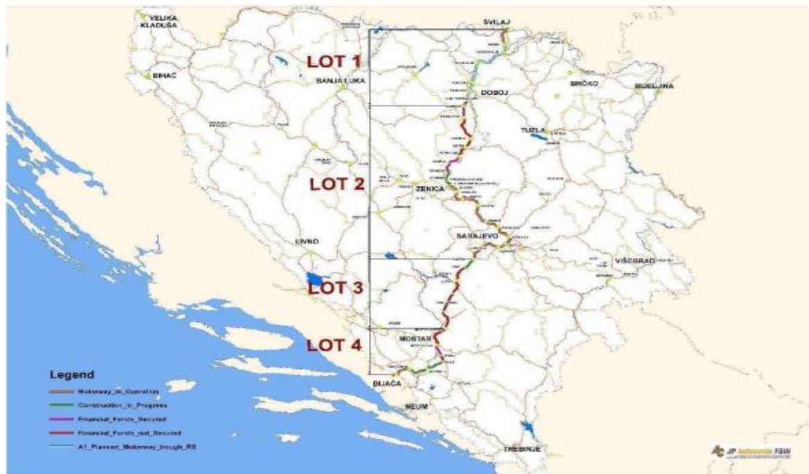
Fig 1. Overview of the Corridor Vc route

The part of the Corridor Vc that passes through the Federation of Bosnia and Herzegovina totals 273 km. Apart from this, plans include construction of motorway section from the Republic of Croatia - Orašje – Tuzla – Žepče and Adriatic-Ionian motorway, and several expressways which make a basis for connection of the Federation of BiH in regional and further international traffic flows of contemporary roads. The construction of expressways on the following routes is also planned: