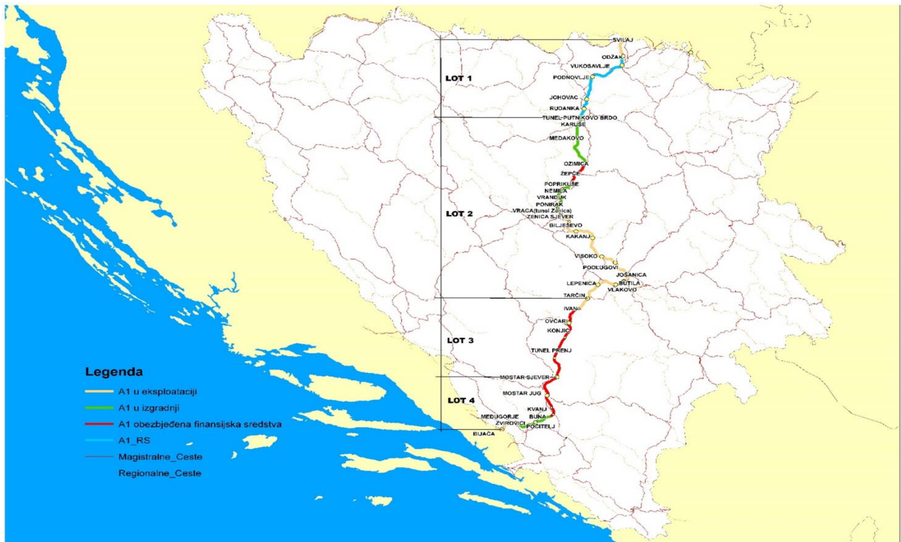
Figure 1. Overview of the route of Corridor Vc in the Federation of Bosnia and Herzegovina

* yellow: A1 in expropriation; green: A1 under construction; red: A1 funds for construction obtained; blue: A1_ Republika Srpska; purple: main roads; regional roads